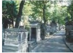
16, rue du Repos (20th). M° Père-Lachaise. Daily, except public hols.

Countesses, black cats, Gothic chapels and famous people – Apollinaire, Chopin, Colette, Éluard, Kardec (the father of Spiritism), Jim Morrison, Musset, Piaf, Proust, Oscar Wilde ... weave a thousand tales that will capture your imagination and set you dreaming.