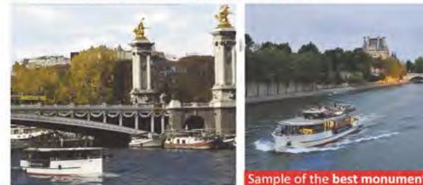
Sample of the best monuments

+ Possibilities of group bookings from 20 people