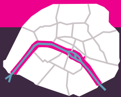
Bridges • River Seine • Quays • Ports