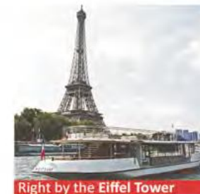
Right by the Eiffel Tower