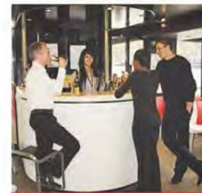
Exclusive: A bar on board